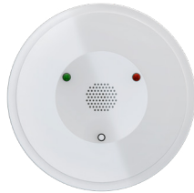
2GIG-GB1E-900 Glass Break Detector