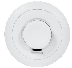
2GIG-SMKT-900 Smoke/Heat/Freeze Detector