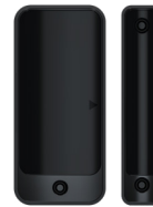
2GIG-DW30E-900 Outdoor Wireless Contact Sensor